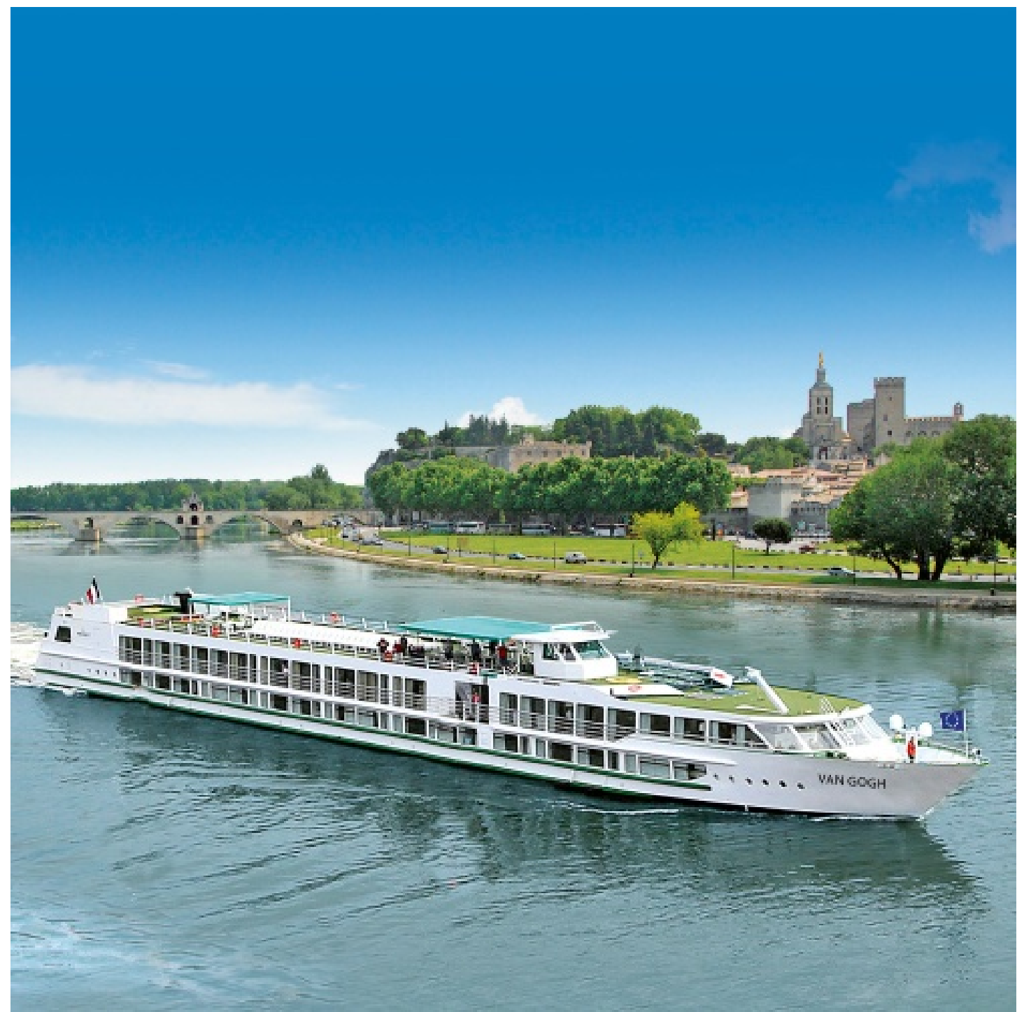
5 anchors - Rhone and Saone - 54 cabins